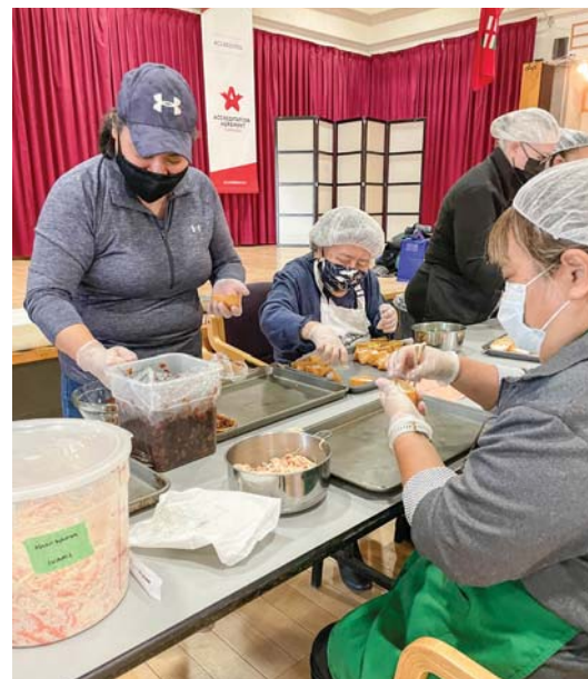
Momiji volunteers preparing food for Something Oishii. (Photos by Caitlin Kaneko).