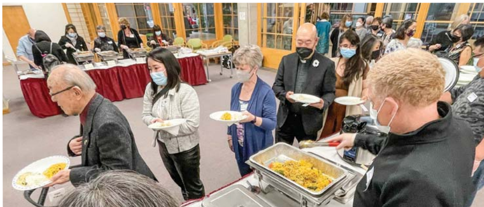
Momiji staff and board members serve attendees.