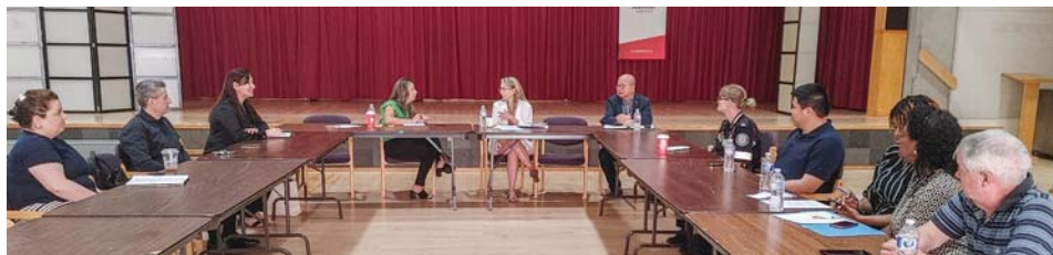
AvantAge Ontario meeting at Momiji.