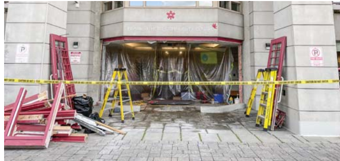
Above: Removal of the old door. Below: The new front door.

The new door has definitively made our facility more accessible to all seniors, especially frailer seniors and those with mobility issues, allowing them to become more involved in our programs and services. A ribbon cutting ceremony will be held in the near future to celebrate this project. ■