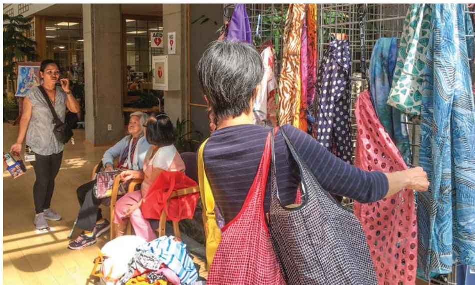
Residents, staff, and guests enjoying the Yard Sale.