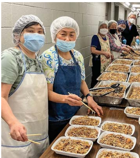
Volunteers preparing chow mein to be sold at Momiji's 2023 Bazaar.

Thank you to all Momiji Volunteers for your hard work and contribution. ■