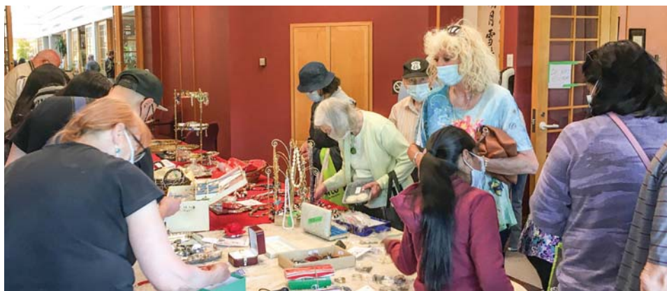
The Bazaar's Jewellery Department as the Bazaar opens, and during the event.

An incredible $38,000 was raised for the seniors here at Momiji and in the Community. ■