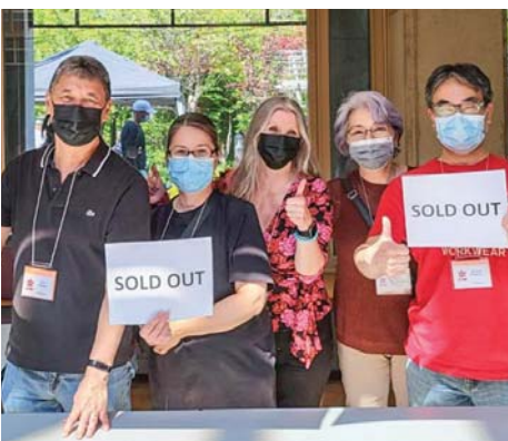
Volunteers celebrating after selling all the sushi at the Bazaar. (Photo by Caitlin Kaneko).