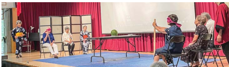
Above: A watermelon smashing competition at July's Summer Festival.

These fun celebrations would not be possible without the amazing volunteers and staff who helped SALC organize, plan, and run these events! A huge thank you to everyone who has helped make these events possible and successful! We look forward to bringing Momiji more events and great weekly programs. ■